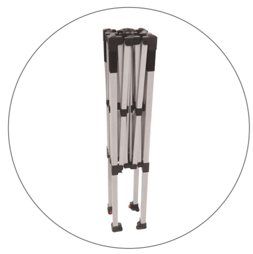
(qty 1) Canopy Frame