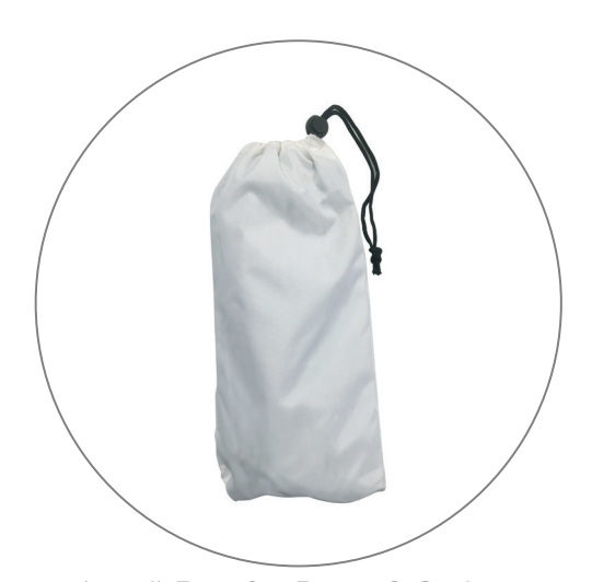
(qty 1) Bag for Rope & Stakes