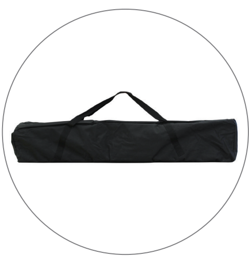
(qty 1) Travel Bag