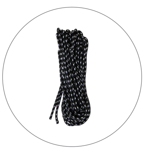
(qty 1) Rope